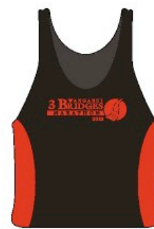
Quality 'Dri Gear' fabric

Orders on the day will incur a $5.00 p&p additional fee