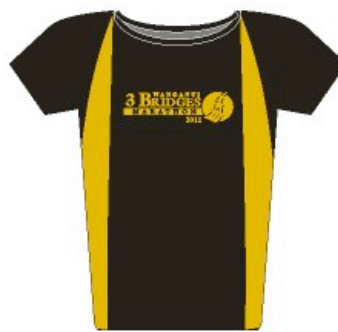
Quality 'Quick Dry' fabric

We have included the measurements next to the size of the T Shirt. This is a half chest measure, taken from middle of the chest round the side, to the middle of the back